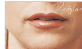
After - treatment with Restylane