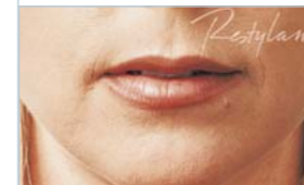
Before - treatment with Restylane