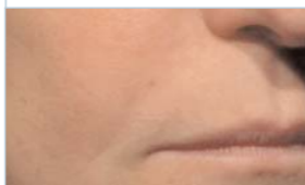
After - treatment with Laresse