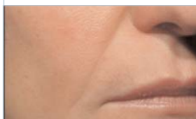
Before - treatment with Laresse

At Phoenix Treatment Centre we use a range of dermal fillers. Our qualified cosmetic practitioners will discuss these with you and recommend the most suitable for you.